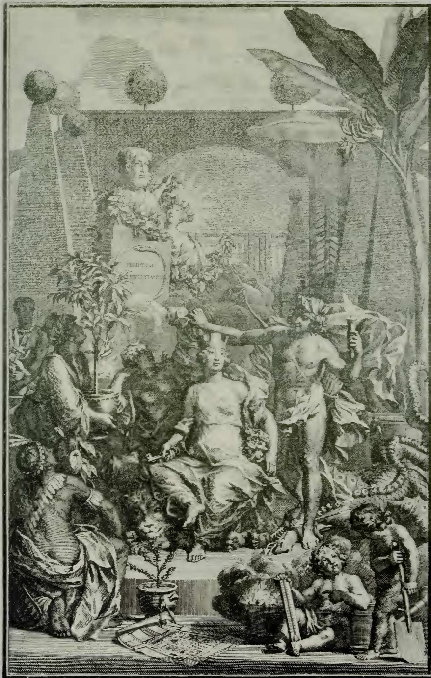
Figure 2.- Copperplate engraving of Linnaeus as the frontispiece of Hortus Cliffortianus (LINNAEUS [41]). The illustration shows Linnaeus as the young Apollo (bearing a flamed torch on his left hand), bringing knowledge against ignorance (see CALLMER & GERTZ [7] for an interpretation of this illustration).